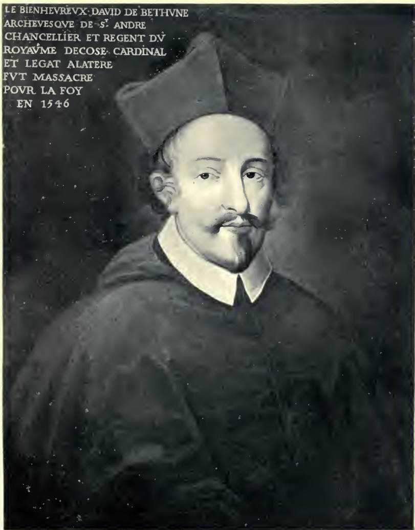
CARDINAL BETON Archbishop of St. Andrews

LE BIENHEUREUX DAVID DE BETHVNE ARCHEVESQVE DE S t . ANDRE CHANCELIER ET REGENT DV ROYAUME DE COSE. CARDINAL ET LEGAT ALATERE FVT MASSACRE POVR LA FOY EN 1546